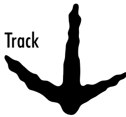
Track 3.5 to 4.5 inches long